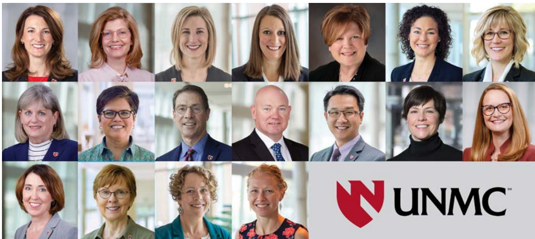
The 2024 University-wide Departmental Teaching Award winner: Physical Therapy, UNMC

Nominators and those submitting materials should consider that the selection committee consists of individuals with various disciplinary backgrounds and expertise, and should therefore use language that relates to a wide audience.