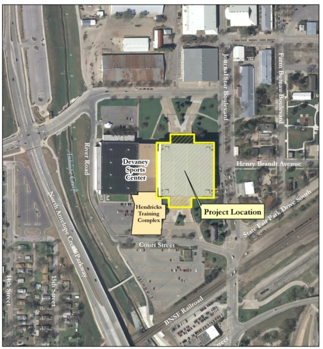
Devaney Sports Center Improvements Project Location Map