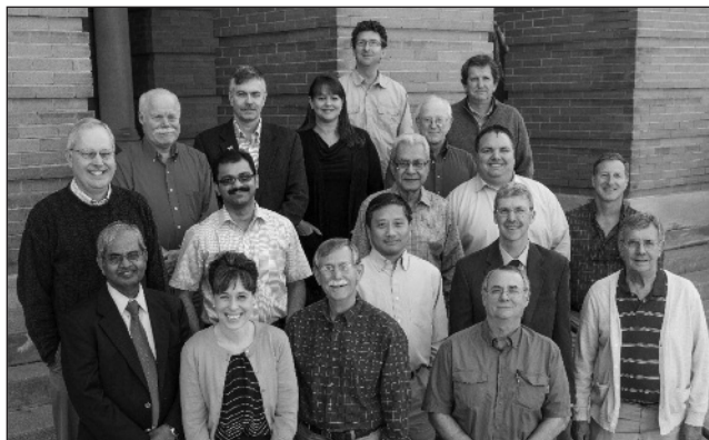
The 2015 University-wide Departmental Teaching Award winner, the Department of Entomology, UNL

Nominations exceeding documentation guidelines will be returned to the Chancellor's Office for submission under the above stated guidelines.